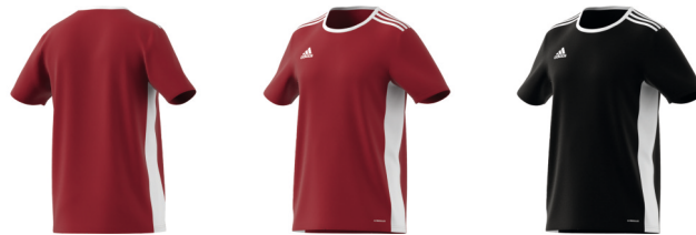
CF1038 01/01/23 CF1035 01/01/23