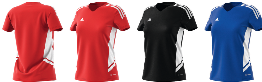
HD4725 01/01/23 H21258 01/01/23 HD4724 01/01/23