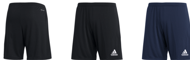
HB0575 12/01/22 H57488 12/01/22