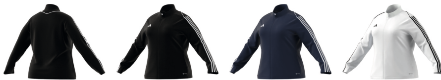
HS3518 01/01/23 HS3519 01/01/23 HS3520 01/01/23

TIRO23 LEAGUE TRAINING JACKET WOMENPLUS $55.00 S2306GHTT203WIN