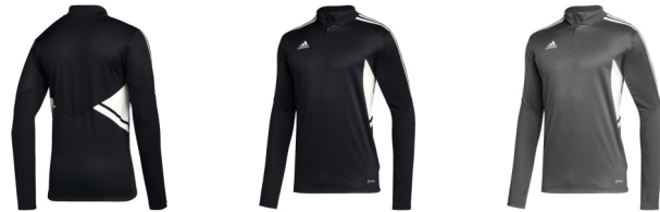
HA6269 01/01/23 HD2312 01/01/23