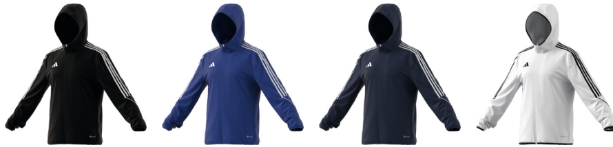
HZ9066 01/01/23 IA1619 01/01/23 HZ9067 01/01/23 HZ9068 01/01/23