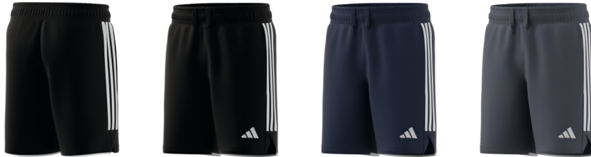
HS3595 01/01/23 HS3596 01/01/23 HZ3014 01/01/23

TIRO23 LEAGUE SWEAT SHORT YOUTH $40.00 S2306GHTT210Y