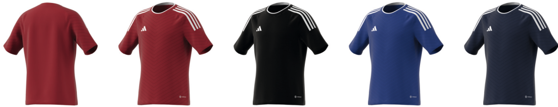
HR2648 12/01/22 HS0537 12/01/22 HR2650 12/01/22 HR2649 12/01/22