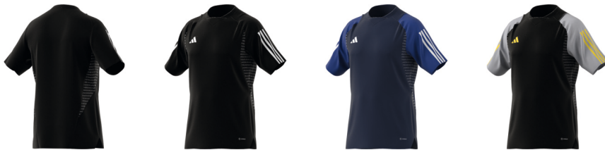
HK7638 01/01/23 HK7637 01/01/23 HU1295 01/01/23