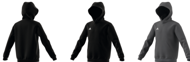
H57516 12/01/22 H57515 12/01/22

ENTRADA22 Sweat Hoody Youth S2206GHTT406Y