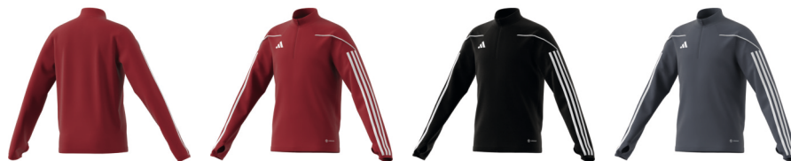
HS3489 01/01/23 HS3487 01/01/23 HS3491 01/01/23