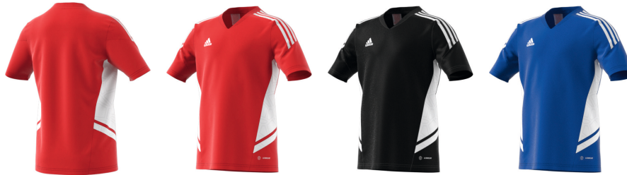
HA6280 01/01/23 HA6278 01/01/23 HA6279 01/01/23