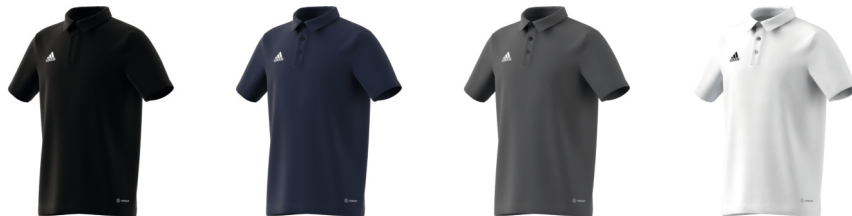
H57481 12/01/22 H57493 12/01/22 H57485 12/01/22 HC5059 12/01/22