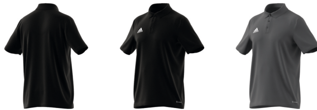
HB5328 12/01/22 H57486 12/01/22