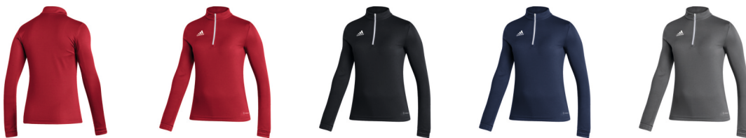
H57551 12/01/22 H57541 12/01/22 H57483 12/15/22 H57542 12/01/22