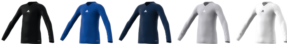
GN5710 12/01/22 GK9087 12/01/22 GN5712 12/01/22 GN5709 12/01/22 GN5713 12/01/22