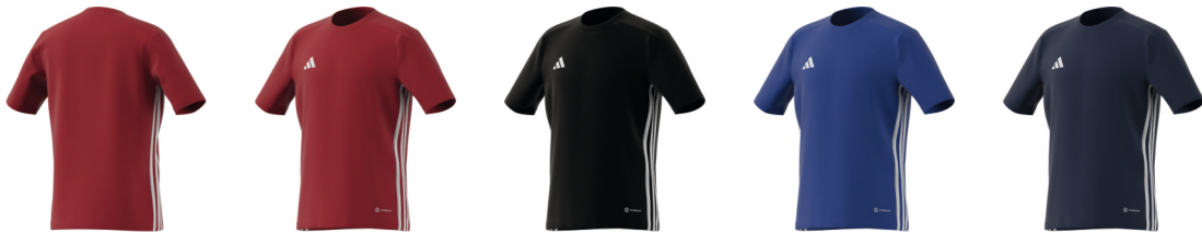
HS0539 12/01/22 H44535 12/01/22 H44536 12/01/22 H44537 12/01/22