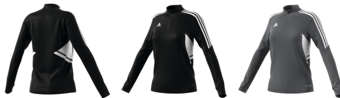
H21250 01/01/23 HD2308 01/01/23