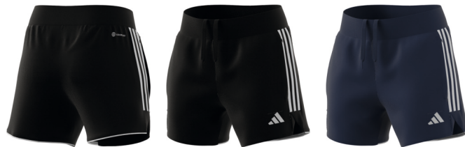
HS0324 01/01/23 HS0320 01/01/23