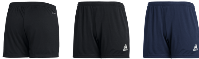
H57492 12/01/22 H57494 12/01/22