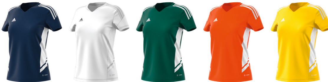
HA6289 01/01/23 HD4728 01/01/23 HE3060 01/01/23 HE3061 01/01/23 HD4730 01/01/23