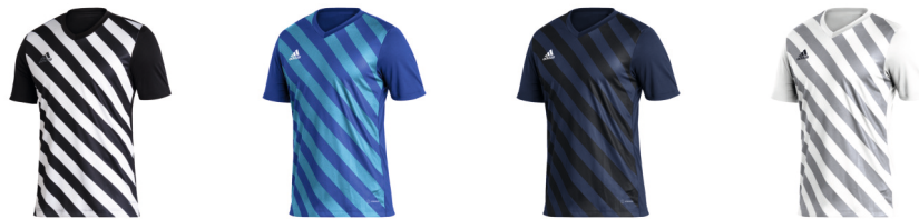
HF0126 12/01/22 HF0116 12/01/22 HF0131 12/01/22 HF0129 12/01/22