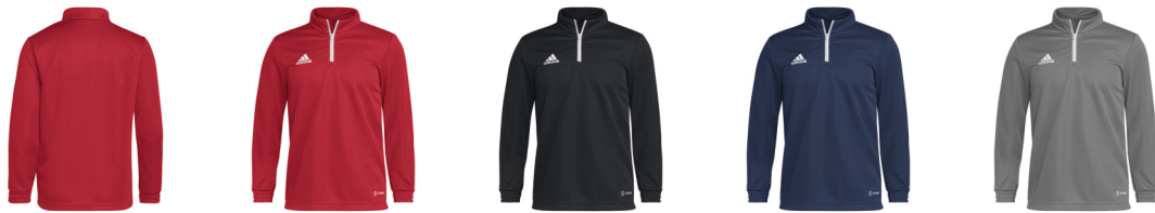
H57550 12/01/22 H57547 12/01/22 H57484 12/01/22 H57549 12/01/22