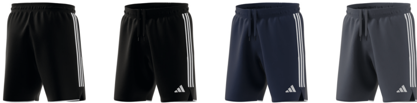
HS3592 01/01/23 HS3594 01/01/23 HZ3017 01/01/23