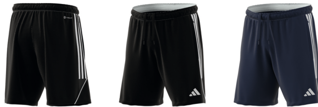
HS0319 01/01/23 HS7226 01/01/23