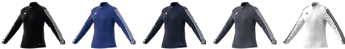
HS3515 01/01/23 HS3514 01/01/23 HS3511 01/01/23 HS3516 01/01/23 HS3513 01/01/23