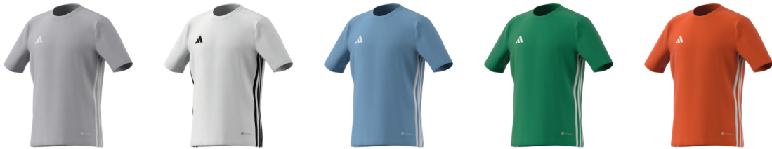
IA9153 12/01/22 H44534 12/01/22 IA9155 12/01/22 IA9157 12/01/22 IB4934 12/01/22