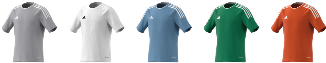
IC1240 12/01/22 IC1241 12/01/22 IC1242 12/01/22 IB4924 12/15/22 IC1243 12/01/22