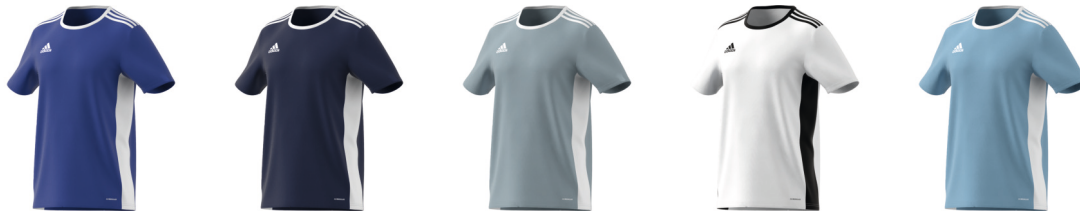
CF1037 01/01/23 CF1036 01/01/23 CD8382 02/01/23 CD8438 01/01/23 CD8414 01/01/23