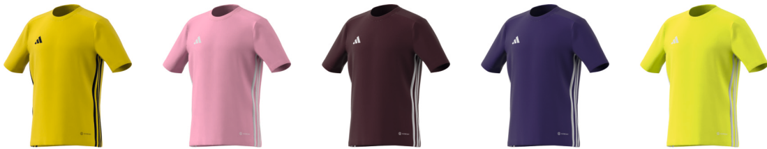
IA9156 12/01/22 IA9154 12/01/22 IB4933 12/01/22 IB4935 12/01/22 IB4936 12/01/22