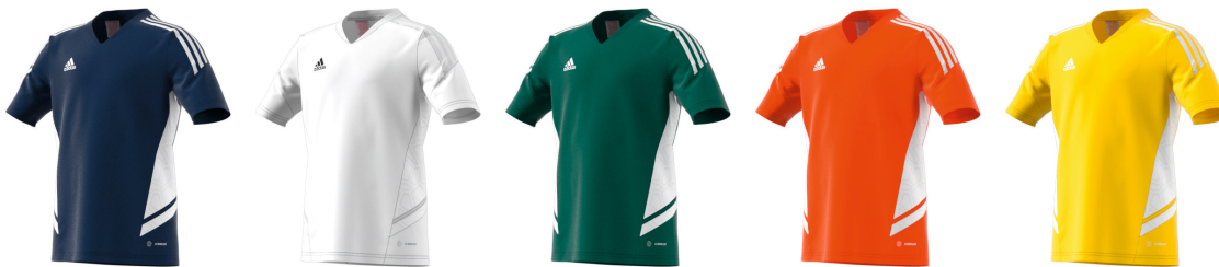
H21257 01/01/23 HD4718 01/01/23 HE3064 01/01/23 HE3065 01/01/23 HD2321 01/01/23