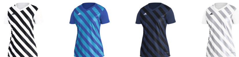
HE2984 12/01/22 HE2988 12/01/22 HE2986 12/01/22 HE2987 12/01/22