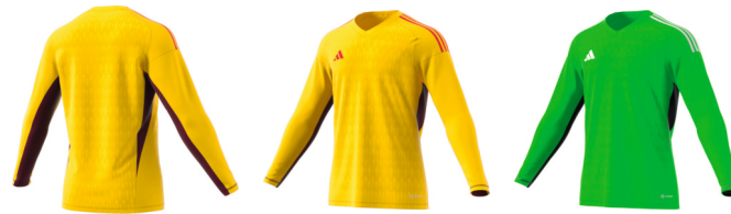
HK7696 12/01/22 HK7693 12/01/22

TIRO 23 COMPETITION GK JERSEY LONGSLEEVE $60.00 F2206GHTM003L