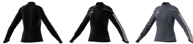
HS3484 01/01/23 IC7877 01/01/23