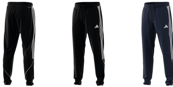
IB5012 01/01/23 IB5013 01/01/23