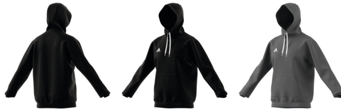
H57512 12/01/22 HB0578 12/01/22