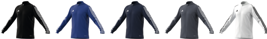
HS7231 01/01/23 HS3505 01/01/23 HS3503 01/01/23 HS3504 01/01/23 HS3501 01/01/23