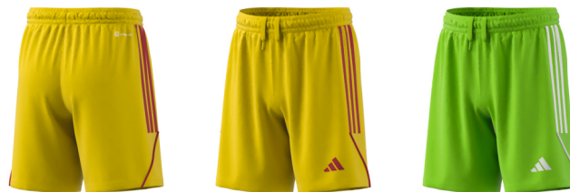
IB8100 01/01/23 IB8097 01/01/23