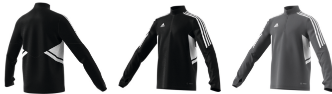
H21249 01/01/23 HD2303 01/01/23

CONDIVO22 TRAINING TOP YOUTH S2206GHTT004Y