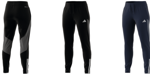
HI5973 01/01/23 IC4609 01/01/23

TIRO23 COMPETITION TRAINING PANT WOMEN S2306GHTT106W Sizes: XXS | XS | S | M | L | XL | XXL; Tall S | M | L | XL | XXL; Tall + 2" S | M | L