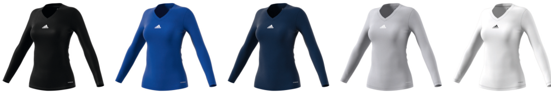
GN5718 12/01/22 GK9089 12/01/22 GN5714 12/01/22 GN5717 12/01/22 GN5716 12/01/22