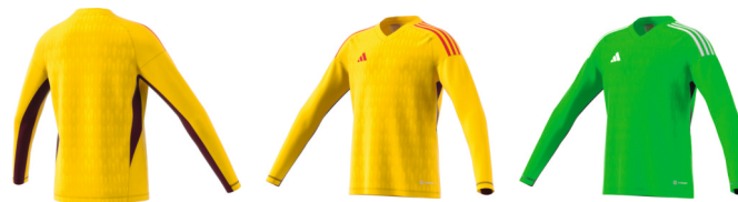
HK7689 12/01/22 HK7686 12/01/22

TIRO23 COMPETITION GK JERSEY LONGSLEEVE $60.00 F2206GHTM003LY