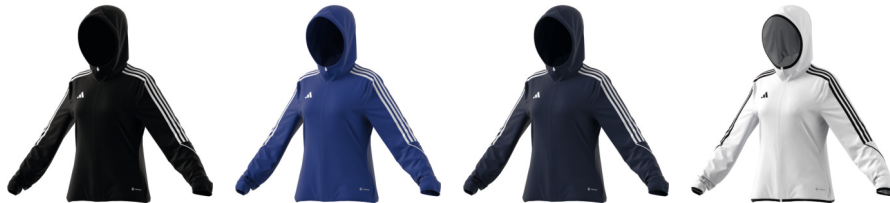
IA1633 01/01/23 IA1630 01/01/23 IA1629 01/01/23 IA1631 01/01/23