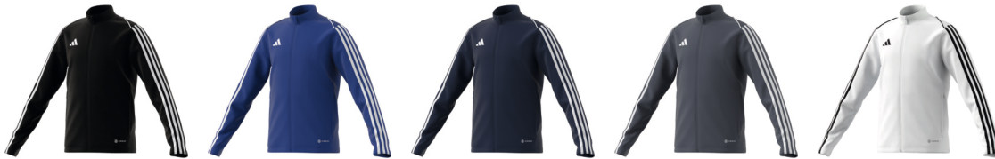
HS3522 01/01/23 HS3526 01/01/23 HS3525 01/01/23 HS3523 01/01/23 HS3524 01/01/23