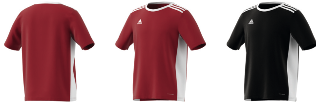
CF1050 01/01/23 CF1041 01/01/23