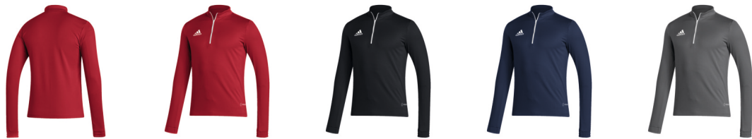
H57556 12/01/22 H57544 12/01/22 HB5327 12/01/22 H57546 12/01/22