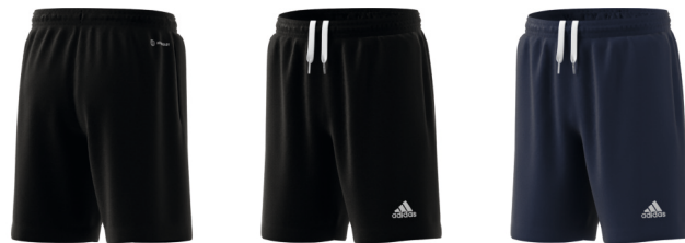
H57498 12/01/22 H57500 12/01/22