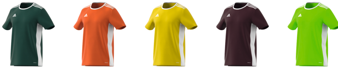
CD8358 01/01/23 CD8366 01/01/23 CD8390 01/01/23 CD8430 01/01/23 CE9758 02/01/23