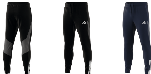
HC5483 01/01/23 HK7652 01/01/23