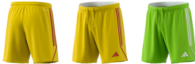
IB8091 01/01/23 IB8088 01/01/23